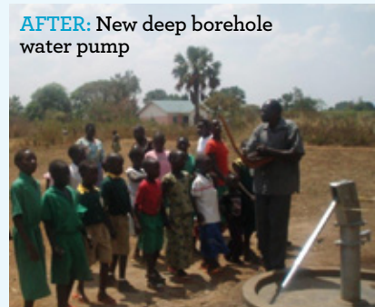
AFTER: New deep borehole water pump