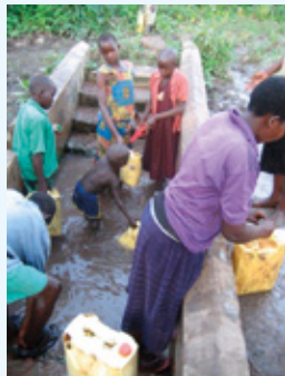
BEFORE: Previous water facility

others beyond. This evolved through a 'bag packing' event in Sainsbury and donations from the congregations of the town's St Peter's Episcopal and St Michael's Parish Churches and patrons of both the Star & Garter Hotel and Livingston's Restaurant. The congregations of St Columba's Episcopal Church, Bathgate and St Columba's Parish Church, Stewarton also made an invaluable contribution for which villagers in Northern Uganda are extremely grateful. The two 'before and after' photographs featured highlight the difference that the first of the proposed five water installations has made in providing what is a fundamental human requirement.