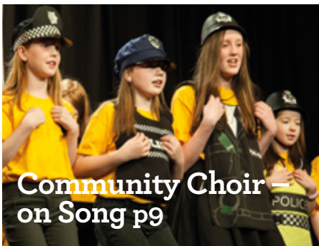
Community Choir — on Song p9