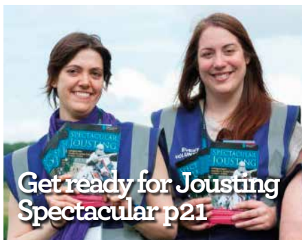
Get ready for Jousting Spectacular p21