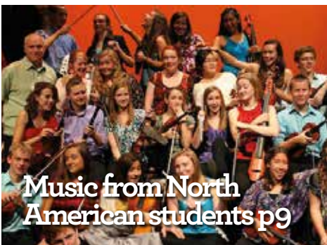
Music from North American students p9