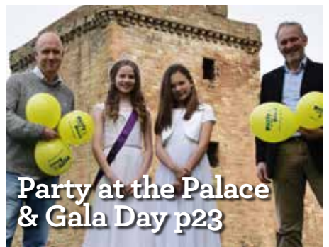
Party at the Palace & Gala Day p23